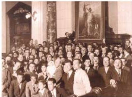
The people and the Republic in A Coruña's City Council chamber.