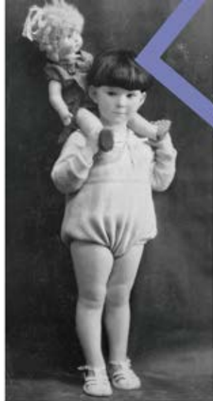
María Casares, 1926.

Since 1996, the annual awards granted to Galician actors and actresses have born the name of María Casares. She bequeathed her home in Alloué (France) to the local council, who converted it into a residence for artists.