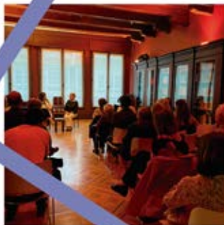
Activities in the library on the second floor.