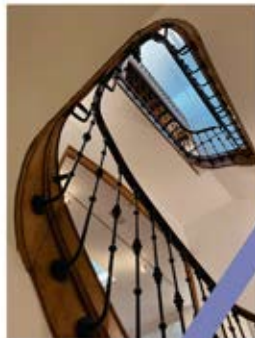
Staircase leading to the museum.

The third floor is dedicated entirely to María Casares.