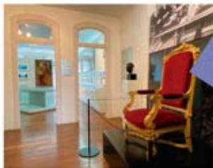
Close-up of Azaña's chair and the bust of Casares Quiroga on the first floor.