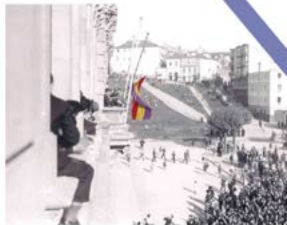
The republican flag flying from the balcony of A Coruña City Hall. Photograph 3825.